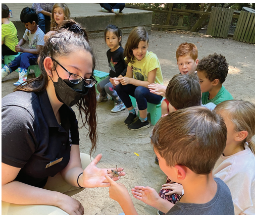
Summer Reading Program: Insect Discovery Lab

Foundation funding supported the Children's Summer Reading Program, Dare to Read . Expenditures covered the cost of performers and contractors for programs, part-time staffing, supplies, reading logs, and flyers.