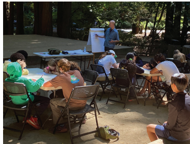
Drawing with the Cartoon Art Museum

Foundation funding supported the Teen Enthusiasts Book Club (facilitator and books) and the Summer Reading Program, Dare to Draw . 74 teens participated in various weekly programs, including Drawing with the Cartoon Art Museum and a Zombie Escape Room . Other programming throughout the year included Reaching Out with Robotics .