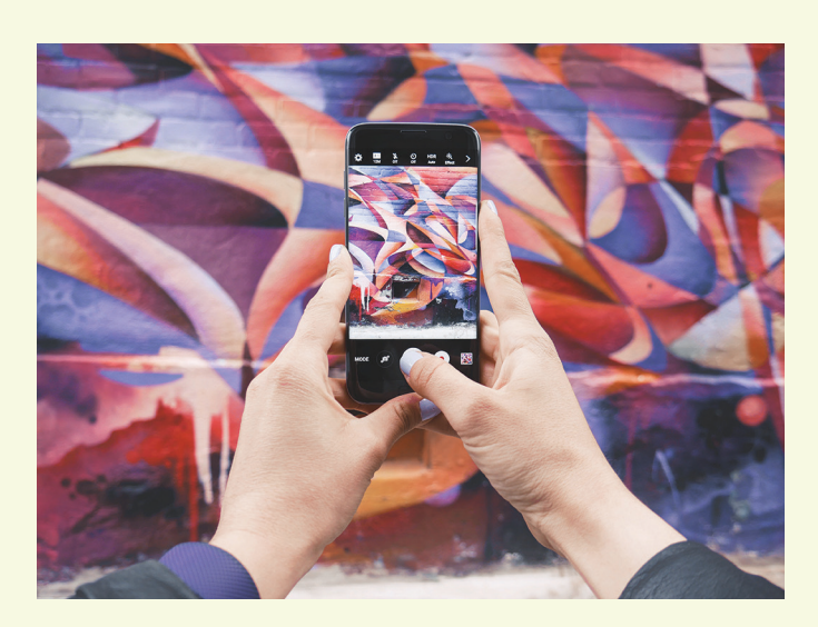
All Things Apple Classes Covered iPhones and other topics.