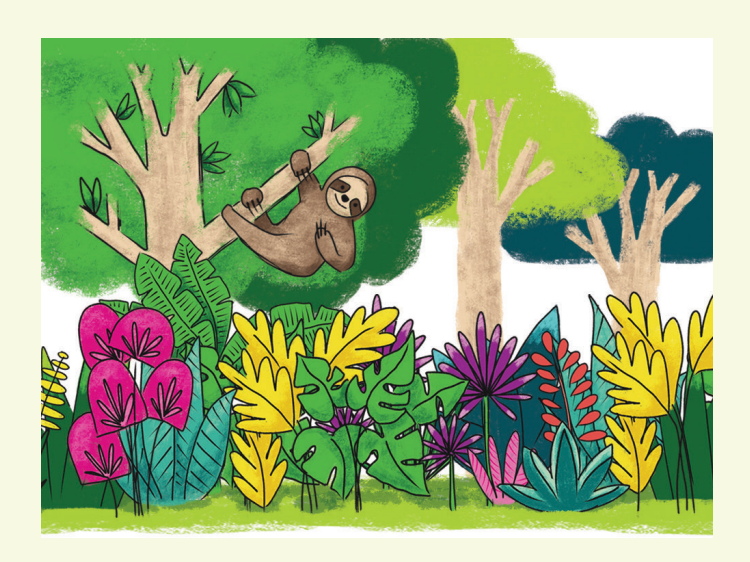
Children's Summer Reading: Wild About Books 2020.