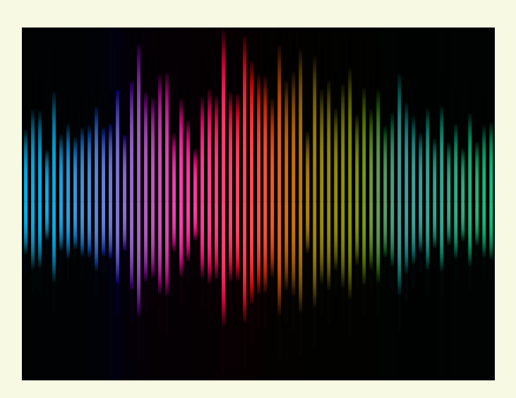
All-time downloads for the Library's podcasts are 4,659 as of 10/12/2020.