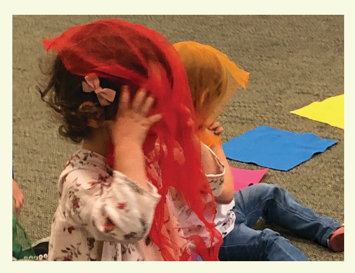
Small Group Storytime.